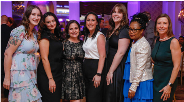
Staff listed left to right

We are proud to once again host three undergraduate Social Work Interns for the 2023-2024 academic year. These students work closely with our Social Work team, and maintain a small caseload of their own. This year's interns join us from Molloy College and Long Island University.